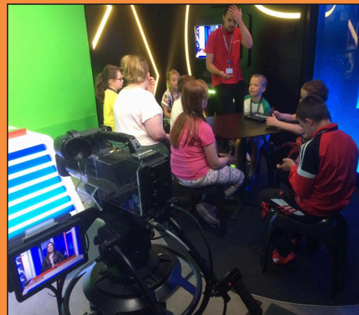
Fun at the Sky TV Skills Academy Studio