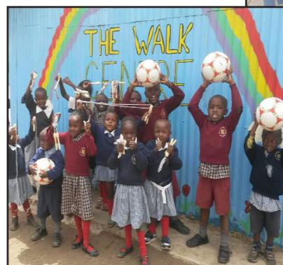
Above: toys donated by Creetown Primary Below: new fridge for orphanage