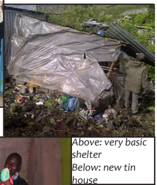
Above: very basic shelter Below: new tin house