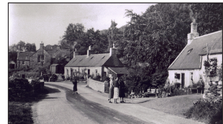
Photo - A view of Carsluith in 1937, showing the village hall and Bridge Cottage, both still standing today, along with the cottages destroyed during a quarry blast in 1939

The free event took place on Saturday 6 th and Sunday 7 th August from 1pm to 5pm daily, as part of the Creetown Gala week of events. Refreshments with home baking were served over the weekend and over 250 people attended the exhibition.