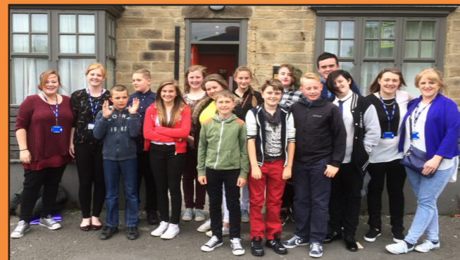
Newcastle Trip - outside hostel (above), print making (below)