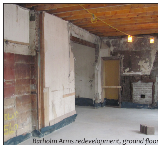
Barholm Arms redevelopment, ground floor

will run the hall. Creetown Initiative will continue to provide support, but the hall belongs to the community and it is up to the community to decide how it's used.