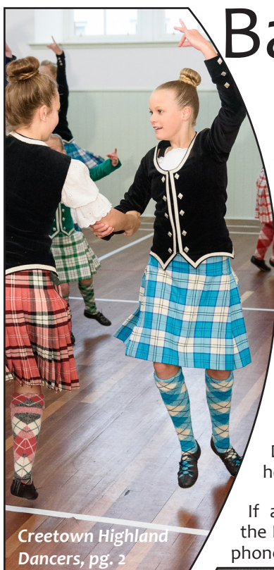
Creetown Highland Dancers, pg. 2