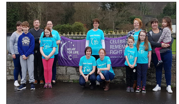
'Wendy's Purple Stars' team 2017